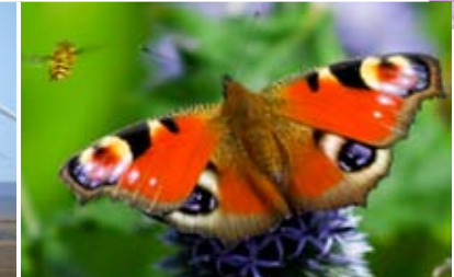
Biodiversity and Ecosystem Service