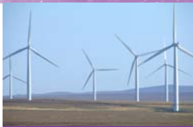
Responding to Climate Change