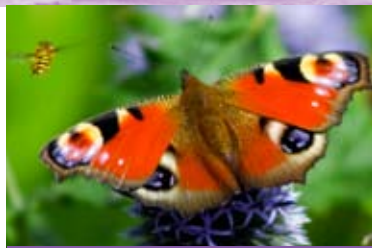
Biodiversity and Ecosystem Service