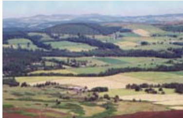
Governance & Participation