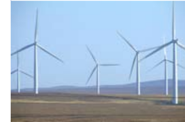
Responding to Climate Change